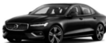
All-New 2019 Volvo S60